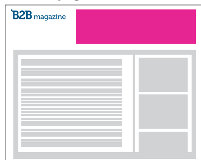
BA3-Internal pages Top banner 728 x 90 px