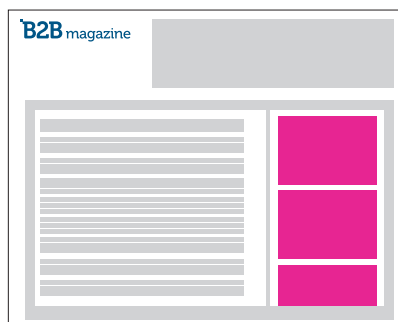
BA4-Internal page Right Sidebar 336 x 260 px