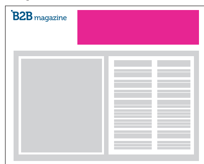
BA1-Hompage Top banner 728 x 90 px